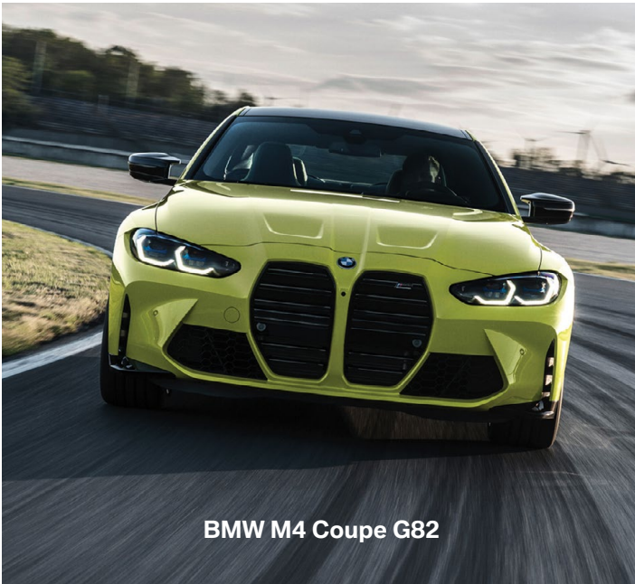
BMW M4 Coupe G82