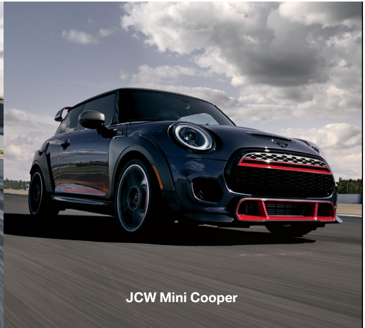
JCW Mini Cooper